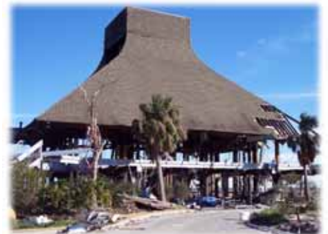
Diamondhead Marina and Yacht House after the storm.