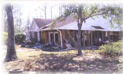
Diamondhead homes after Katrina.