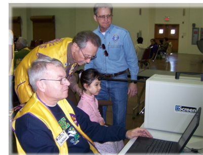
Child being screened.

The screening process is non-invasive, simple and quick. The child's head is placed in front of the camera and a digital picture is taken. The pictures are evaluated to determine if there may be a vision problem.