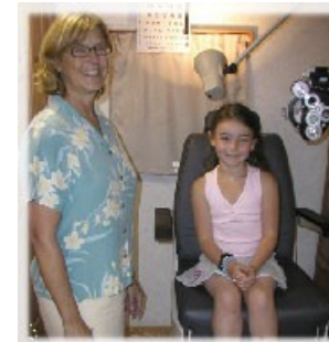
Child receiving eye exam.

If the screening detects the possibility that a child may have a vision problem, the parents of the child are notified by the school nurse or the screening Lions Club. It is imperative that the parents set up an eye exam with an eye professional as soon as possible. If there is a financial problem to cover the exam and treatment for which Medicaid or other state programs are not applicable, the Lions conducting the screening will assist with funds.