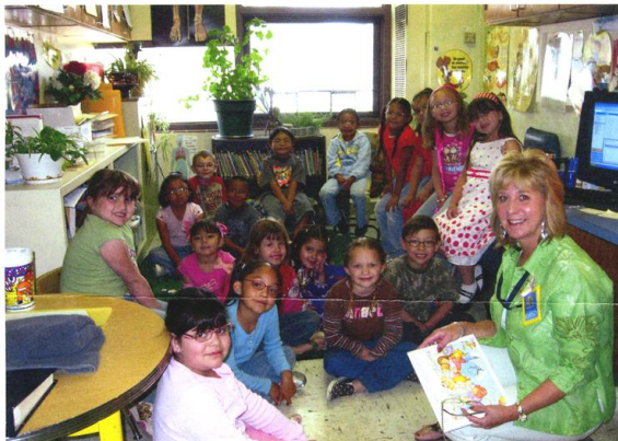
NOB HILL'S EYE POWER CLUB 2007/2008

The smiling faces of these children say THANK YOU in such a big way!!! Thank You to The Noon Lions Club for your support of Children's Vision. The Eye Power Program can continue to give prizes to those children that wear and take care of their glasses thanks to The Noon Lion's Club. Children are important and your gift to the Eye Power Program shows how much you believe that.