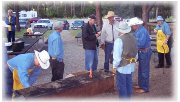
Ruidoso Noon Lions arriving at the camp site at 7AM to begin the cowboy breakfast preparations.