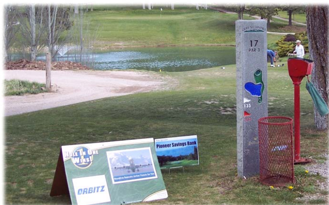
One of the 3-par holes where a prize could be won for a hole-in-one.