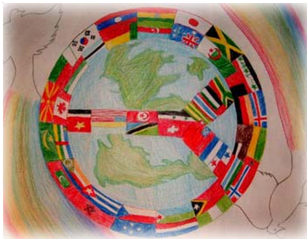
Runner Up - Sky Poncho